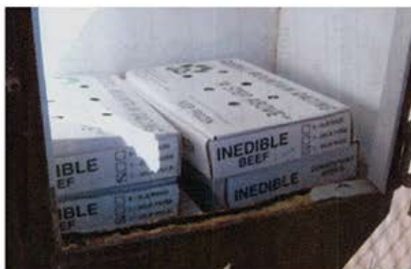
Raw and diseased "4D" meat fed to racing greyhounds

As many as 700 young dogs were kept in stacked metal cages for up to twenty-three hours a day. And when let out to race, these gentle hounds faced the risk of serious injury. One March night, a young dog with the grim name of "Night Mare" fell into the track's inner rail. She was instantly electrocuted before a small crowd of onlookers.